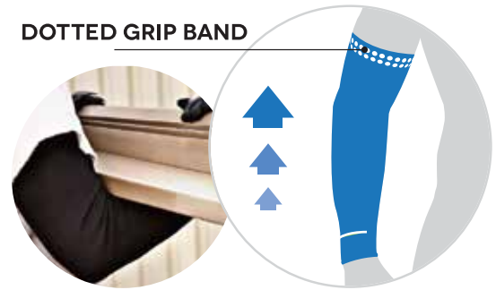
DOTTED GRIP BAND

No more slipping! Sleeves with arm openings featuring "STAYz-Up" technology hold up—comfortably gripping onto underlying fabric or skin to ensure sleeves stay in place, and keep you protected no matter what. Unlike other products on the market, we won't let you down.